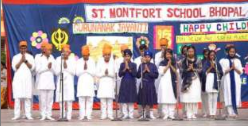
traditional Sikh attire. The assembly commenced with a special prayer, 'ek omkar' sung by the students which filled the whole campus with spiritual ambience and inner peace.

Guru Nanak Jayanti: -The birth anniversary of Guru Nanak Dev Ji was celebrated with great exuberance on 20th Nov. Special assembly was conducted by the students of classes 8th D, E and F to mark the occasion. The students came dressed in