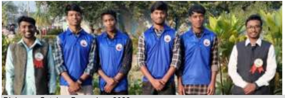
Dialogue, October-December, 2023

Montfort School, Garratola. Celebrating the Silver Jubilee of a school is a monumental event, a testament to its enduring legacy and the impact it has had on countless lives. This milestone is not just a celebration of the institution's existence, but a